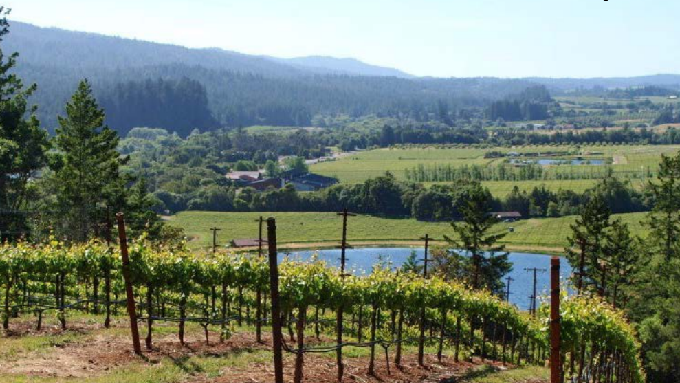
A view of Anderson Valley from Thomas T Thomas Vineyards.